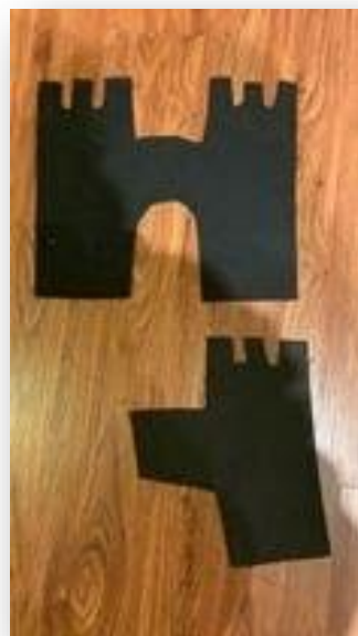
Bridge appliqué for gambeson

The next morning Saturday, April 25 th around 10am I posted my progress on the sleeve and was able to post that I'd almost reached the end of it, a few more hours and I was done.