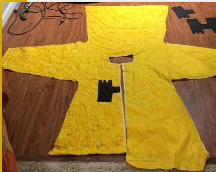
Overall view of my Gambeson and what work I had already accomplished. (the front left panel and left arm a third of the way down were done-ish)

I posted the following pictures for the beginning check in time at 5pm Friday. Then I closed my computer around 7pm and sewed my heart out until 11:14pm that evening.