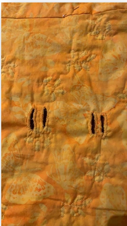
Arm hole Point positions and details