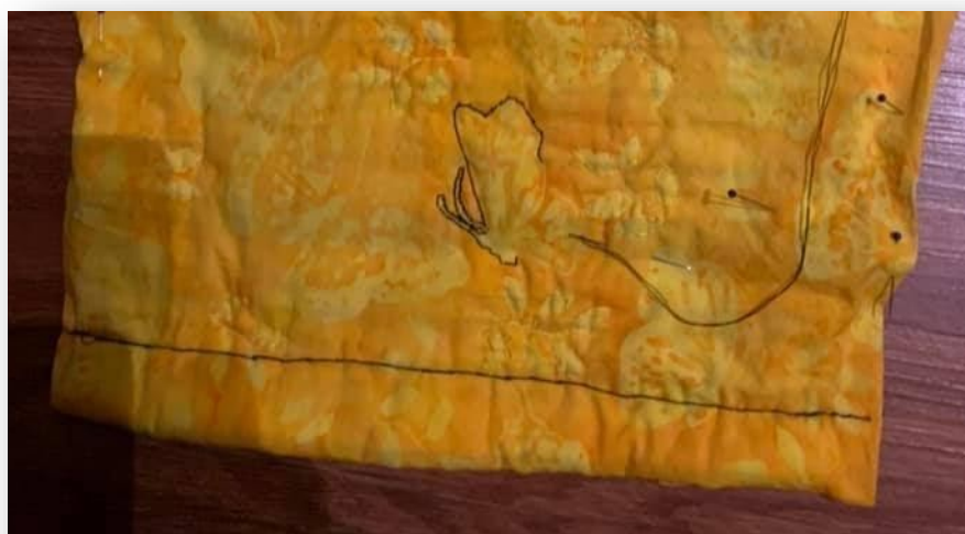
Sleeve detail at check-in Saturday

Sewing all day Sunday, I was able to move from the left shoulder, to the upper back of the gambeson.