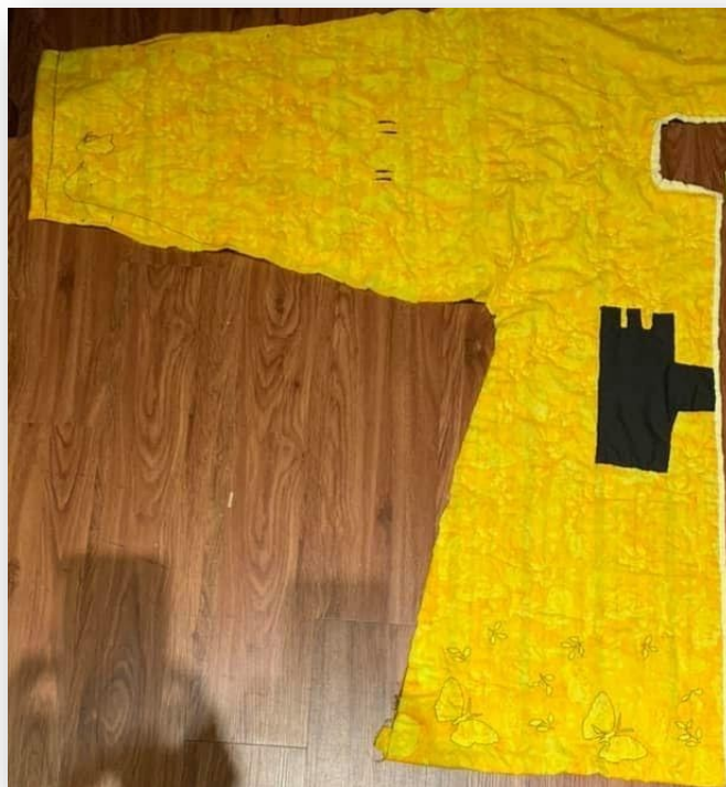
Left Gambeson Sleeve finalized with detail of the decorative aspect in progress