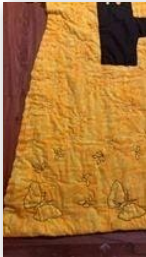
Detail of the Front Left Panel