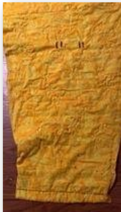
Arm Sleeve View