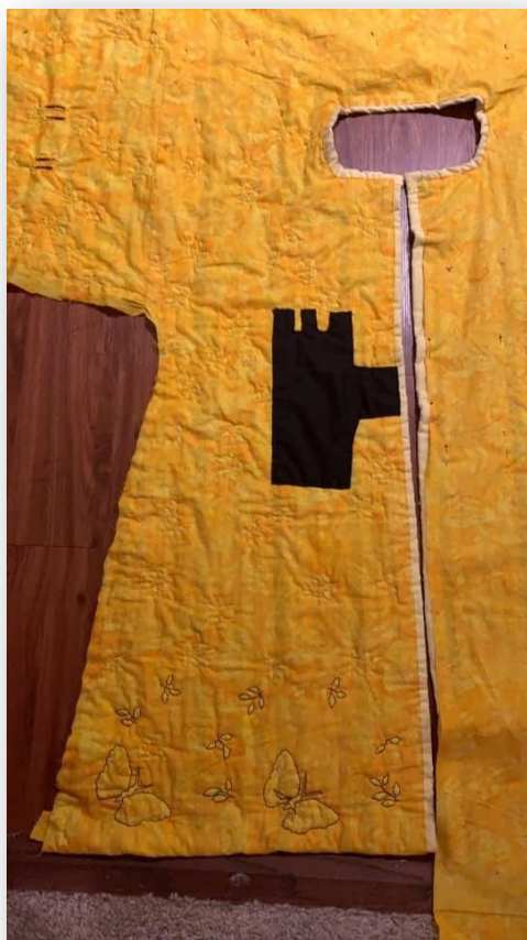
Start of Gambeson with Front Left Panel Finished