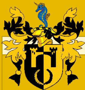
Ponte Alto Baronial Populace Gathering