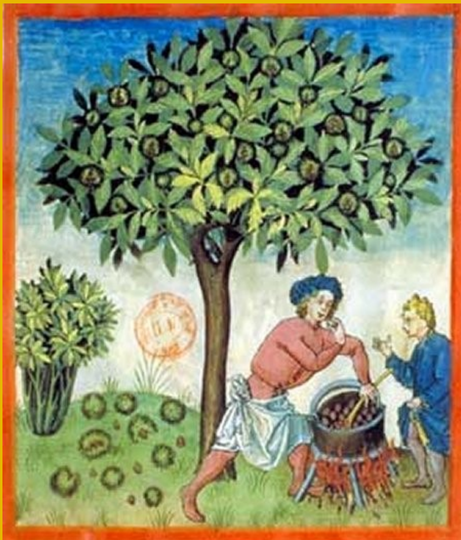
TACUINUM SANITATIS, CA. 1400 CHESTNUTS

This is Volume 27, Issue 5, of Il Tempo (The Times), a publication of the Barony of Ponte Alto, in the Kingdom of Atlantia, of the Society for Creative Anachronism, Inc. Il Tempo is provided at no charge online and in PDF format on the Baronial website. Any member of the Barony of Ponte Alto who does not have internet access may request a printed copy of Il Tempo at no charge from the Baronial Seneschal ( seneschal@pontealto.atlantia.sca.org ).