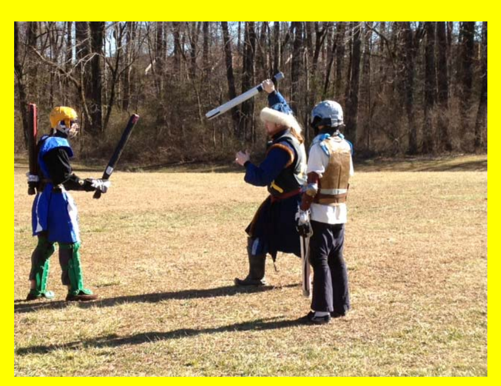
Youth: Our Barony's and Kingdom's Future