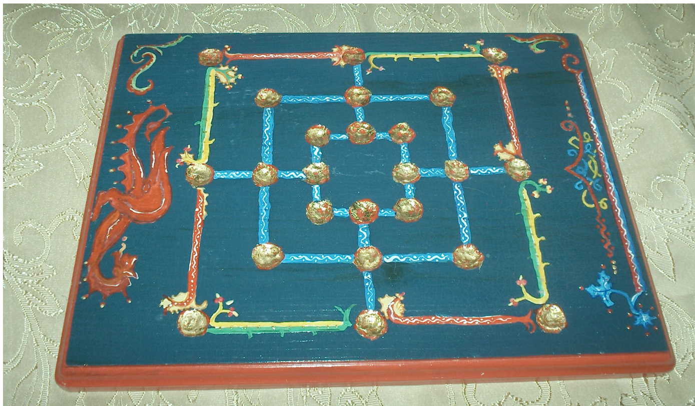
Figure 1. A 9-Man Morris board made by Mavi of Black Diamond.

It is played by two players and required a board with 24 intersections and nine pieces to play (as seen in figure 1.).