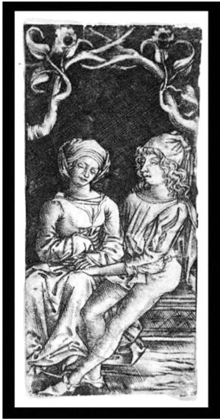
{\bf Two\ Lovers} Late 15 ^{\rm th} century. Niello print. Italy. British Museum

Newsletter of the Barony of Ponte Alto-Volume 18, Issue 2 R February 2009