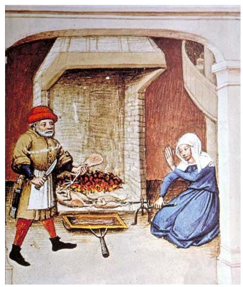
Illustration from an edition of The Decameron, Flanders, 1432. Paris, Biblioteque Nationale, Arsenal, manuscript 5070

Newsletter of the Barony of Ponte Alto—Volume 16, Issue 5<sup>™</sup> April 2007