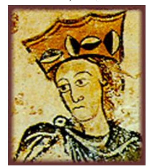
Eleanor of Aquitaine, from an unknown illumination

While traditional historiography conceptualizes the crusades as a masculine movement symbolic of honor and male courage, women were also involved.