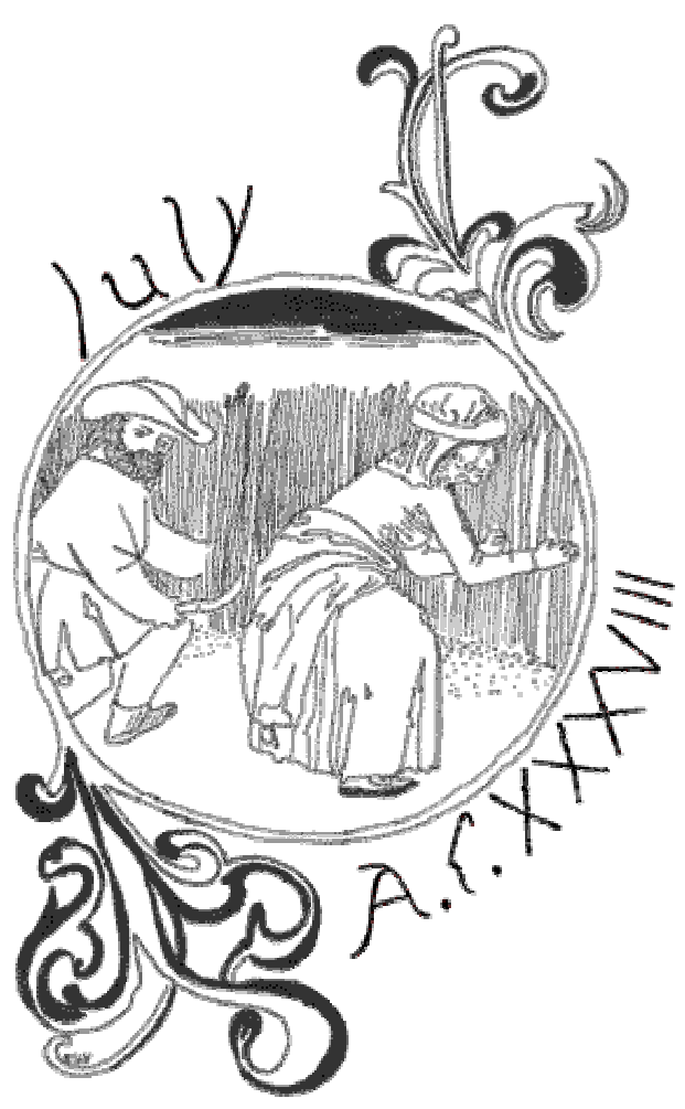
Cover art by Lady Maria-Therese de Normande

Artistic license exercised in representing this piece for Ponte Alto's July cover. Inspiration drawn from Calendar, Labors of the Month, July: a man reaping corn woman binding sheaves, Master of Jean Rolin II—Netherlands-Koninklijke Bibliotheek (museum).